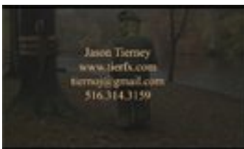
Final name sequence

Animated dropping clouds, shaking nCloth curtains