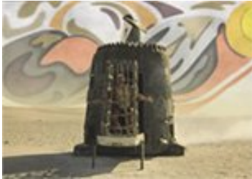
Shot 12 – “Kin Dza Dza”