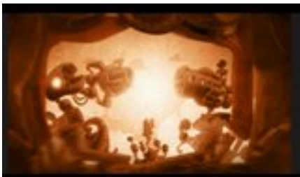
Shot 13 - "The Pig"

Animated dropping clouds, shaking nCloth curtains